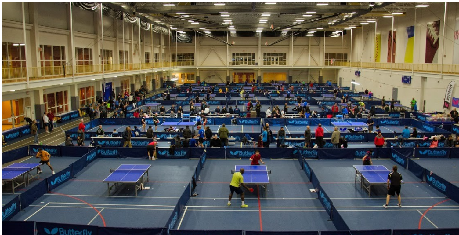
1st place Open Singles Ruichao L Chen